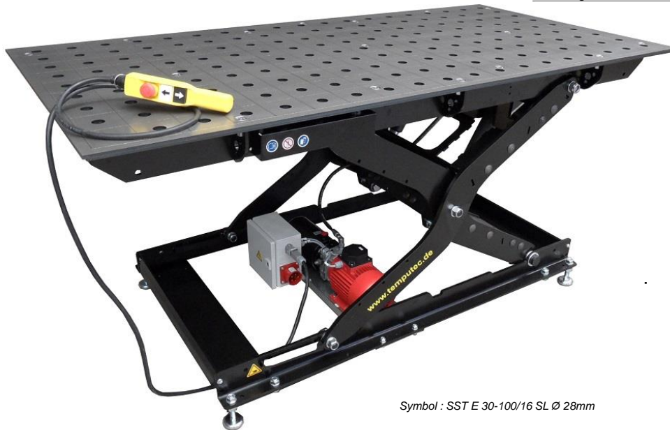
Symbol : SST E 30-100/16 SL Ø 28mm