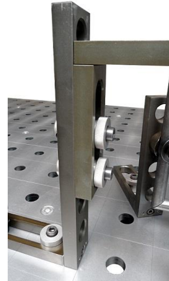
Images: Examples of use Clamping bolt with steel balls